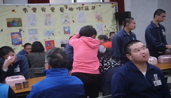
Hug with families