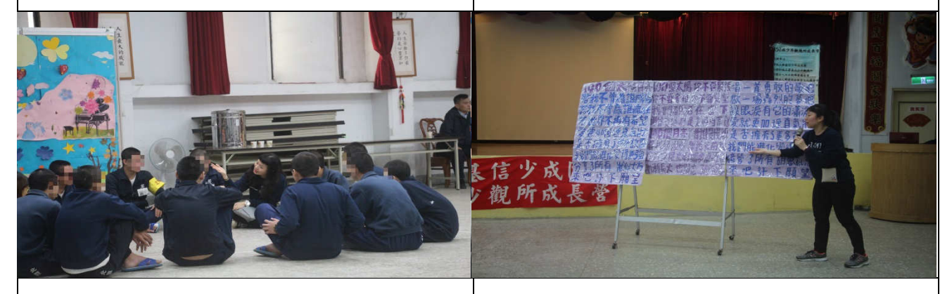
Introduction of each team leaders